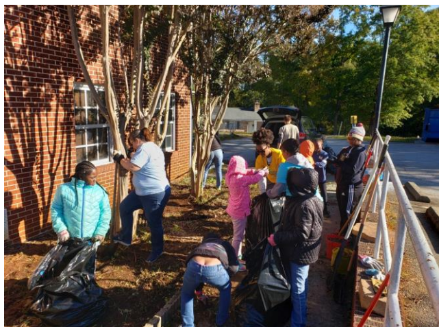
Girls' community service organization The Perfect Pearls redoing the garden at the entry of our new EHS center